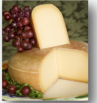
PLEASANT RIDGE RESERVE