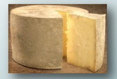
BANDAGE WRAPPED CHEDDAR