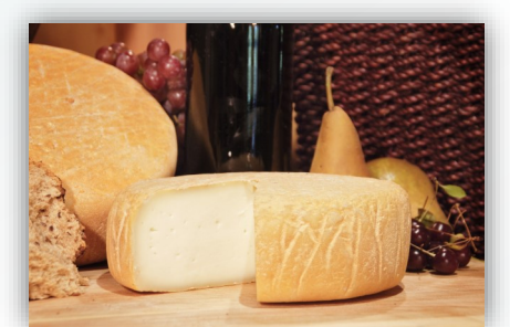
CABRA LA MANCHA